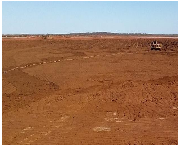
Swamp Dozer profiling of TSF3 after MudMaster compaction. High strength enabling stable landform for future rehab/closure (Mt Weld)