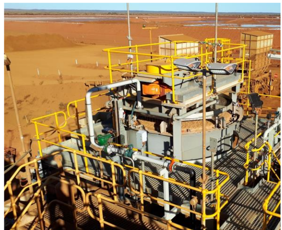
Extra flotation capacity from Stack Cell (Mt Weld)