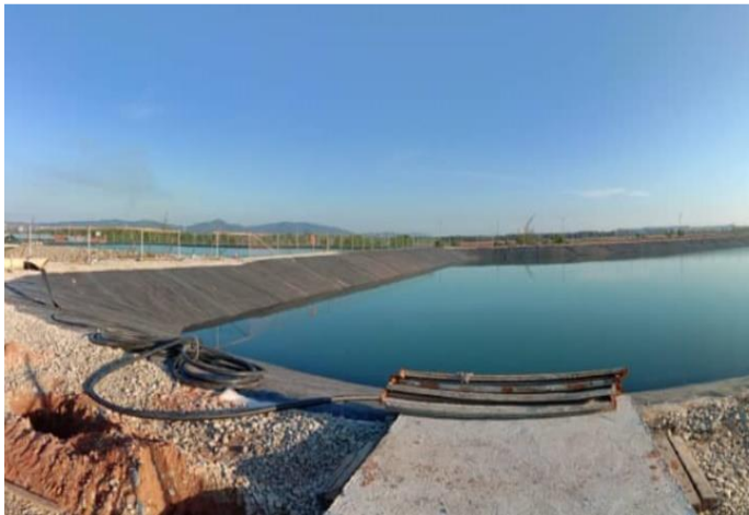
Third Process Water Pond will reduce the risk of water supply disruptions (Lynas Malaysia)