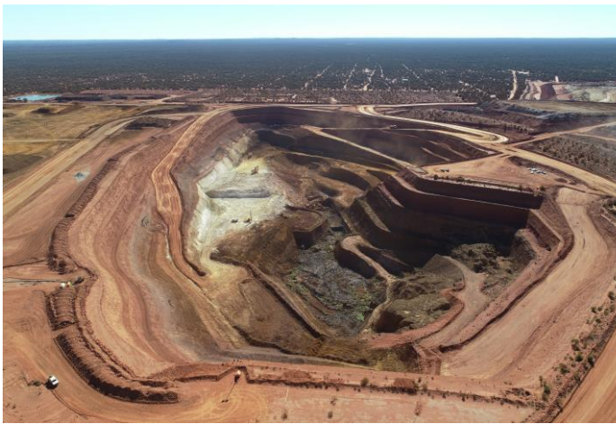
Mt Weld Pit looking north. Mining Campaign 3 cut back on western side

Reclamation of Duncan ore from the stockpile for crushing and screening has commenced. Duncan ore will be included in the concentrator feed blend from the start of the current quarter (ending 30 September 2019) and should reach Malaysia late in the quarter. The Duncan ore zone is an extension of the higher grade Central Lanthanide Deposit (CLD) with higher levels of Heavy Rare Earths including Dy.