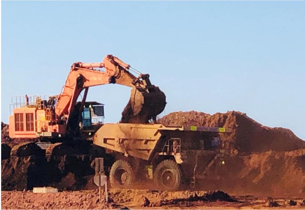
Duncan ore being reclaimed to be included in the Mt Weld feed blend